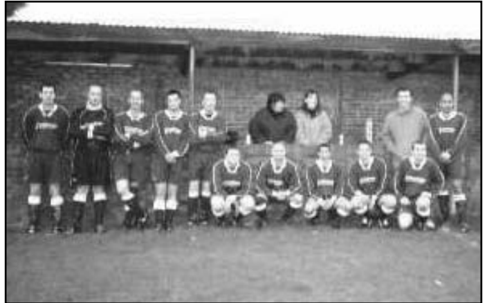
Cranfield Sunday Team