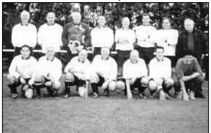
Cranfield Golden Oldies