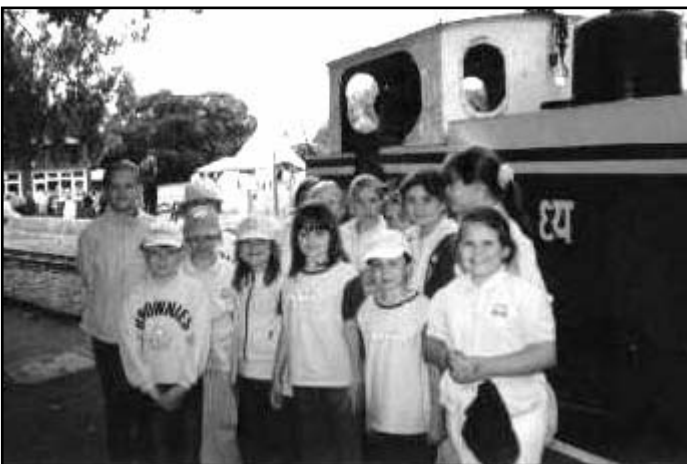
After the train trip at the Magical Day