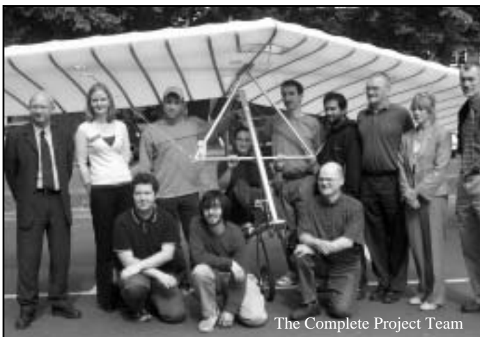
The Complete Project Team

What, of course, this project did was to give the students a hands on opportunity to incorporate an accumulative knowledge in structural design, aerodynamics, propulsion, ergonomics, manufacturing and many other fields. The team have been very busy in the design and manufacture of the machine and any donations and help with the project have been really appreciated along with the biggest booster of all, words of encouragement.