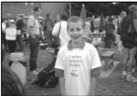
The Fun Run

As part of Sport Relief 2004, Cranfield Student Community Action organised a 1 mile Fun Run on Fri 9th July, just before the annual Cranfield 5k road race. Almost 130 runners took part in the Fun Run, which although not an official Sport Relief Mile, as it was held the day before the main event, nevertheless was an opportunity for local people to be a part of this massive national fund raising event.