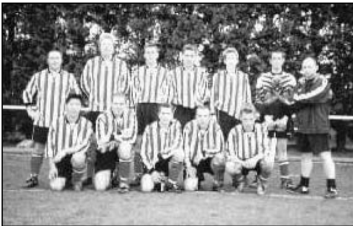
Cranfield Saturday Side