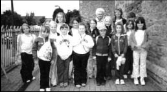
Setting off on the walk

The 2nd Cranfield Brownie Pack have enjoyed a good term with varied and enjoyable activities, many with a keep-fit theme.