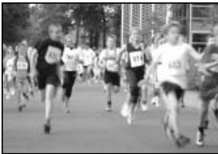
The Fun Run

All those who took part received a commemorative T-shirt, presented by the Student Community Action group and everybody seemed to enjoy the event which took part on one of the only dry evenings that week.