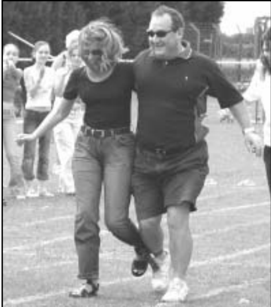
I'm Jake the Peg diddle, iddle, diddle etc

Along the side of the pitch, was what could best be described as a racing car, cunningly disguised as a train engine. This was pulling a wheeled cage behind it, which contained screaming children... It was moving very fast and extremely erratically. My first thoughts were that this was "The Child Catcher" from Chitty Chitty Bang Bang who had come to take the children away. On closer inspection I was delighted to find out that it was the Leighton Buzzard Lions