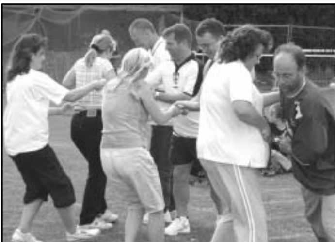
A bit of a scramble in the change over in the egg and spoon race

A number of events took place throughout the afternoon to entertain the assembled throng. Both children and adults sat in the clubhouse and were enthralled and thoroughly entertained by Gerald who made model animals