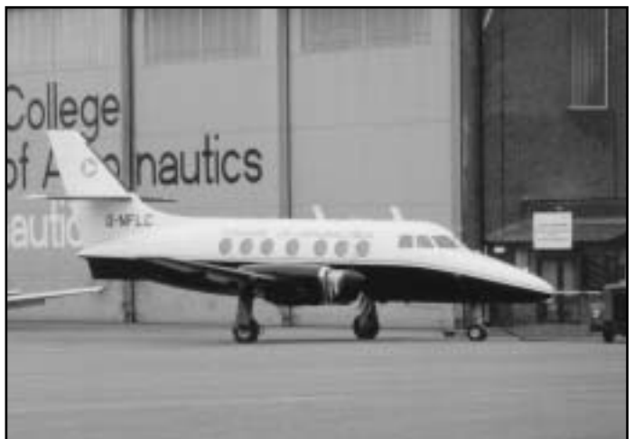
G-NFLC in her new livery in the early nineties