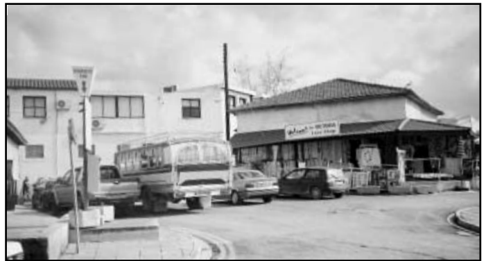
A picture of a village bus! (or To leoforio in Greek).

closed signs are there to be ignored. If there is nothing blocking the way you just manoeuvre around the cones and proceed along a road that's not much different from any other, the pot holes might just be bigger. They only seem to put an inch thick layer of tarmac (presumably because they will be digging it up again in a couple of weeks) And the first heavy rain fall opens all the pot holes again. Zebra crossings are another hazard for both pedestrians and drivers. Everybody ignores the zigzag markings either side and cars are always parked, more often than not across the crossing. Pedestrians use these crossings at their peril. In fact the only drivers who stop at them are either expats or holiday makers - who are easy to spot as hire cars have red number plates. Much as I hate to admit it, the women are far worse than the men. They pull out of side streets without looking, stop suddenly, drive at an incredibly slow speed and generally dither about. Motor cyclists are much the same as in the UK. By law they have to wear crash helmets, sadly the law does not state where these helmets